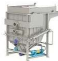
DISOLVE AIR FLOATATION SYSTEM