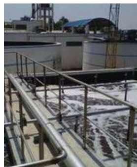
CETP PLANTS (Common Effluent Treatment Plants)