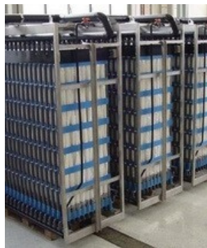
MBR STP Plant (Membrane Bioreactor Sewage Treatment Plant)