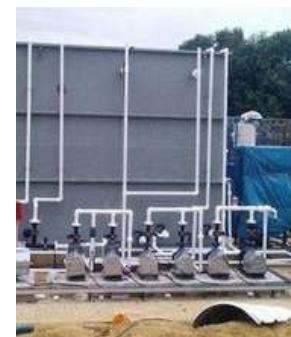
Compact / Portable ETP (Compact / Portable Effluent Treatment Plants)