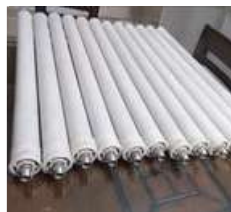
FINE BUBBLE DIFFUSERS