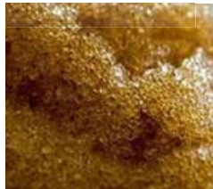
ION EXCHANGE RESIN