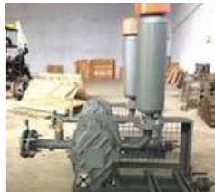
TWIN LOBE AIR BLOWER