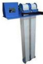
BELT TYPE OIL SKIMMER