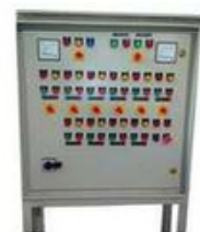
ETP & STP PANEL