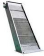
MECHANICAL BAR SCREEN