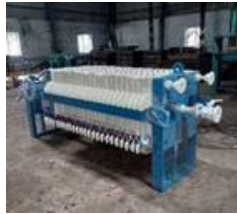
PLATE & FRAME TYPE FILTER PRESS