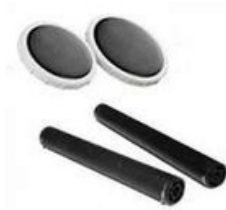
COURSE BUBBLE DIFFUSERS