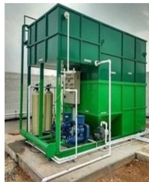
SBR STP Plant (Sequencing Batch Reactor Sewage Treatment Plant)