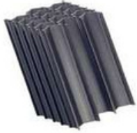
TUBE SETTLER MEDIA