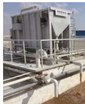
INDUSTRIAL ETP PLANTS (Industrial Effluent Treatment Plants)