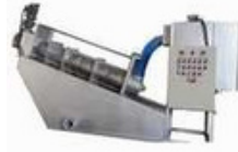
SLUDGE DEWATERING SCREW PRESS