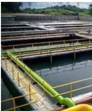
EA STP Plant (Extended Aeration Sewage Treatment Plant)