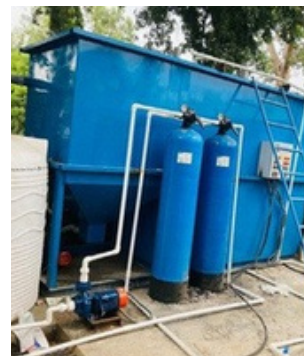
MBBR STP Plant (Moving Bed Biofilm Reactor Sewage Treatment Plant)