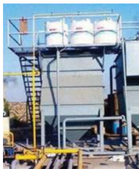
ETP PLANTS (Effluent Treatment Plants)